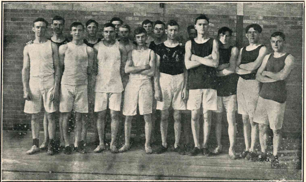
BOYS' BASKET BALL TEAM