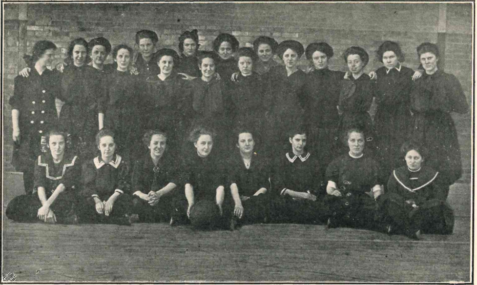
GIRLS' BASKET BALL TEAM