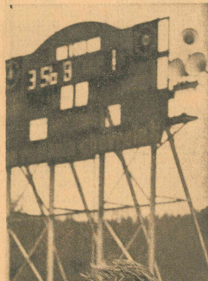
The Twilight Mile runner ends his four-minute