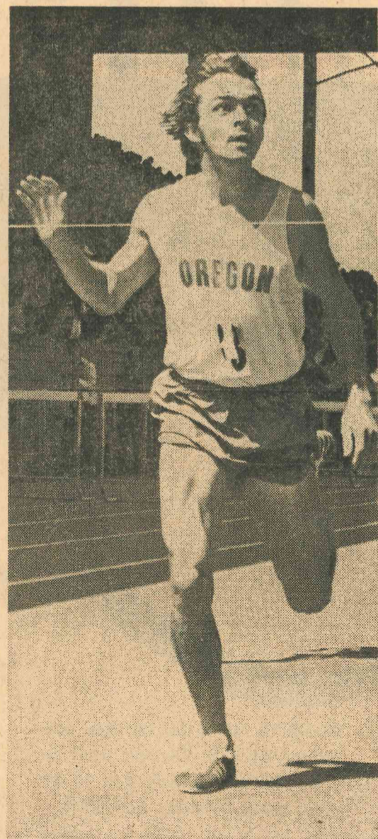
Pre . . . the clock watcher