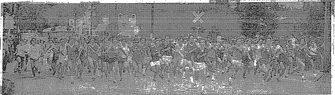
START OF SPARTAN CLASSIC CROSS COUNTRY RUN ON ST. JOSEPH'S MAIN STREET SATURDAY