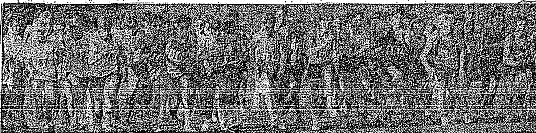
This was the mob scene as 112 runners pushed off in the district high school cross country meet T