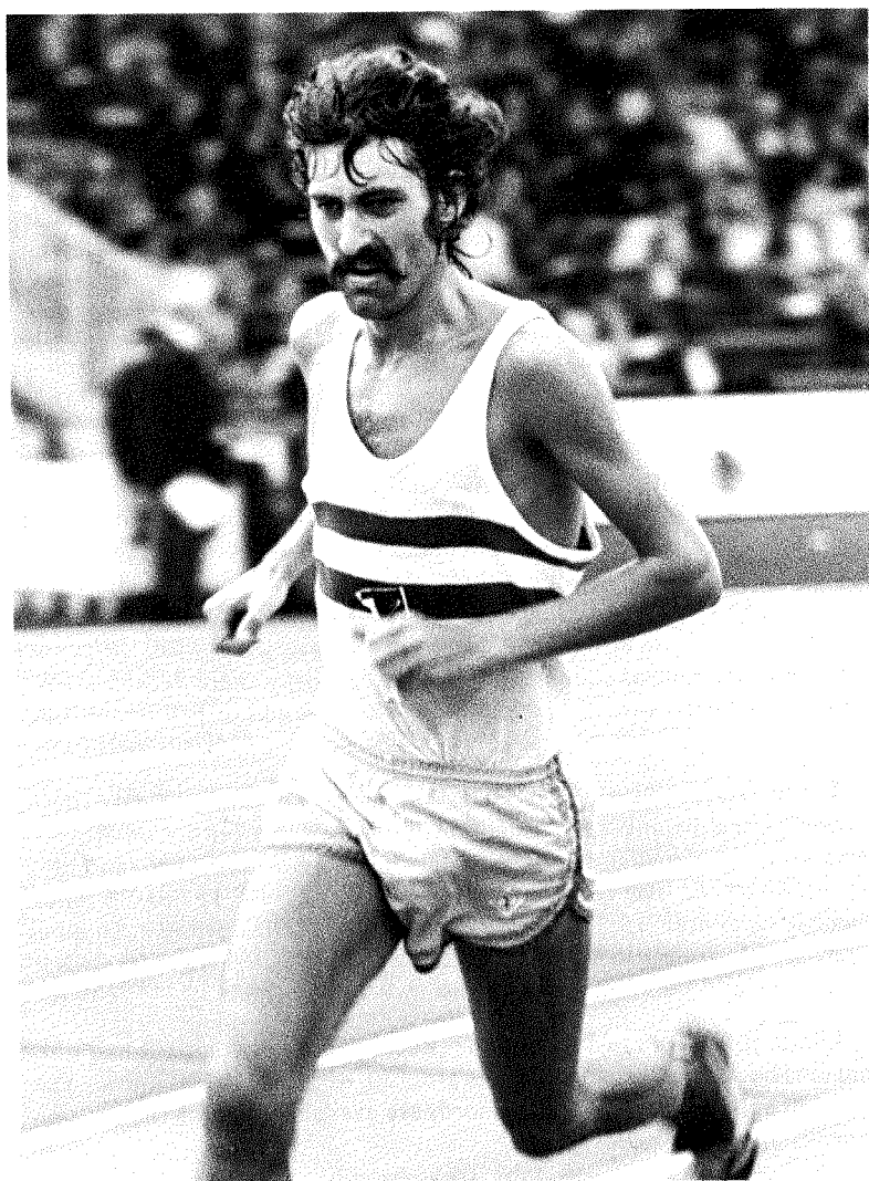
Britain's Dave Bedford set a world 10,000-meter record of 27:30.8 during 1973.