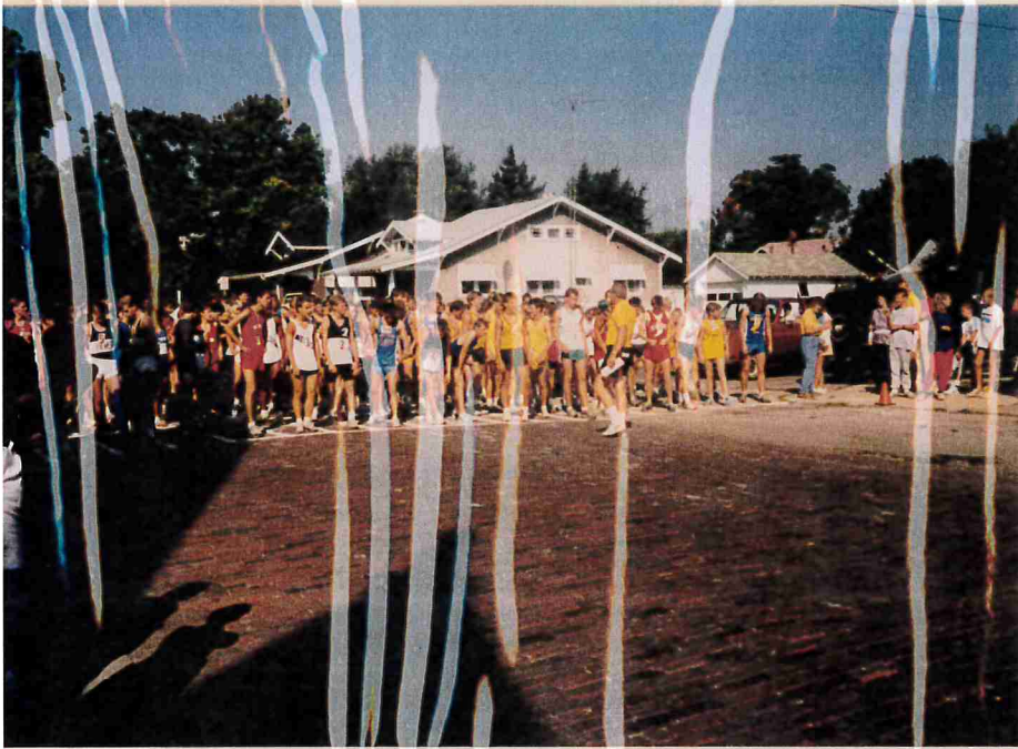
THE PANTAGRAPH, Sunday, Sept. 18, 1988

A triangular meet with Decatur MacArthur and Urbana was scheduled Tuesday. The annual Spartan Classic at St. Joseph will be staged Saturday, starting at 10:30 am. Mahomet-Seymour's boys placed third, its girls fourth, last year.