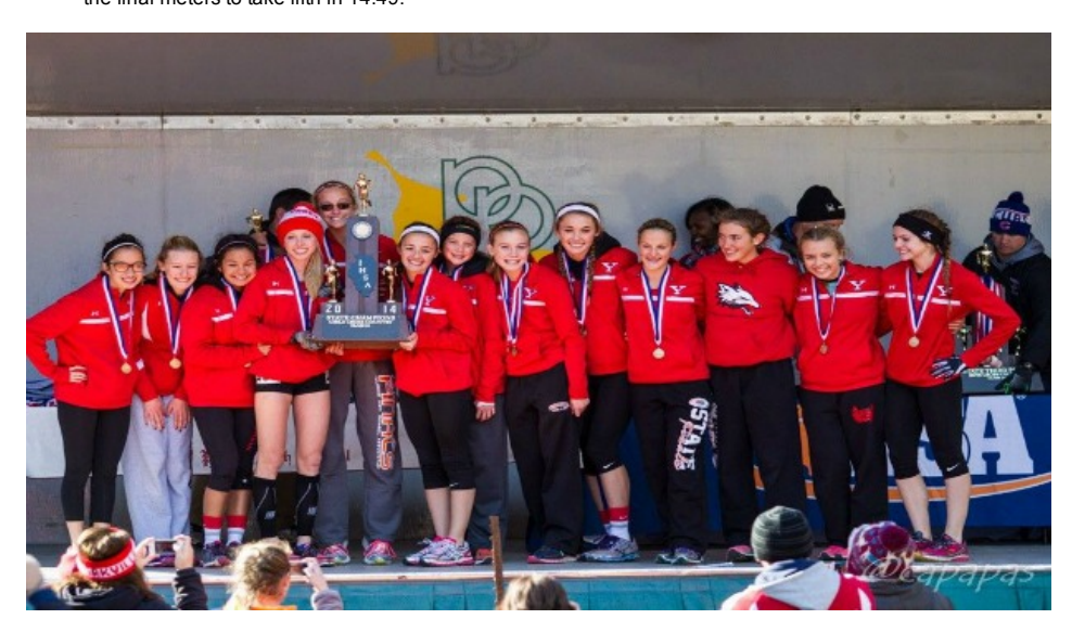
The Yorkville Lady Foxes got their 4-Peat