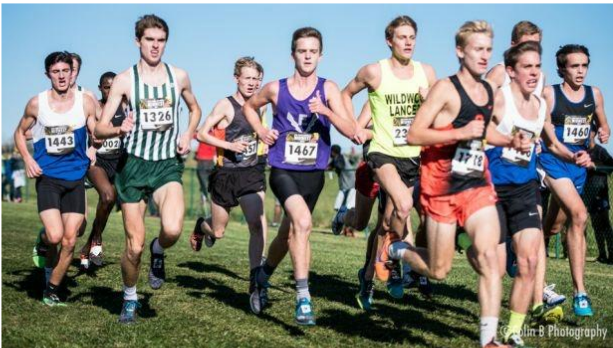
The strategic boys race pack working together in the early stages