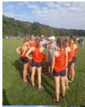
Behind the Rankings - September 19, 2018 - Girls (Today, 4:15pm)