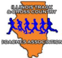
2018 ITCCCA Coaches Poll - 3A Boys - September 19, 2018 (Today, 1:01pm)