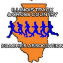
2018 ITCCCA Coaches Poll - 3A Girls - September 19, 2018 (Today, 1:00pm)