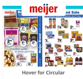
Hover for Circular