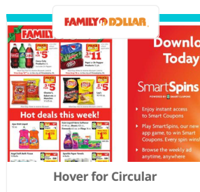
Hover for Circular