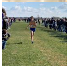
Illinois HS XC State Series - Class 1A Sectional Recaps - November 3, 2019 (Yesterday, 1:00am)