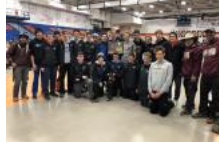
Illinois HS XC State Series - Class 2A Sectional Recaps - November 3, 2019 (Yesterday, 1:01am)