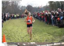
Illinois HS XC State Series - Class 3A Sectional Recaps - November 3, 2019 (Yesterday, 1:02am)