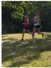
The Illinois HS XC Journal - August 30, 2020 (Aug 30th, 3:21pm)