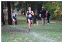
3A Hinsdale Central Sectional (Yesterday, 4:34am)