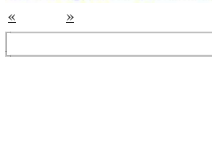
2021 IHSA Class 2A Cross Country Sectional Previews (Oct 28th, 7:02pm)