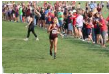
2021 First to Finish Invitational Recap - The Girls Races (Sep 13th, 9:21am)