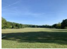
2021 First to the Finish Invitational - Race Previews (Sep 9th, 4:28pm)