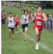
Hinsdale Central runs away with Boys team title behind Watcke win(Sep 5th, 11:27am)