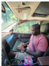
Monday Morning Finish Line - September 6, 2021(Sep 6th, 4:00pm)