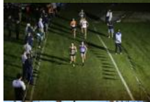
2021 Naperville Twilight Invitational Preview (Oct 5th, 10:04am)