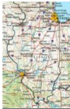
The Illinois XC Roadmap to the Weekend - October 8, 2021 (Oct 8th, 10:28am)