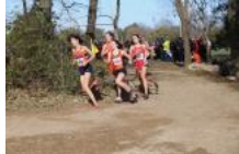
Monday Morning Finish Line - October 4, 2021 (Oct 4th, 9:45am)