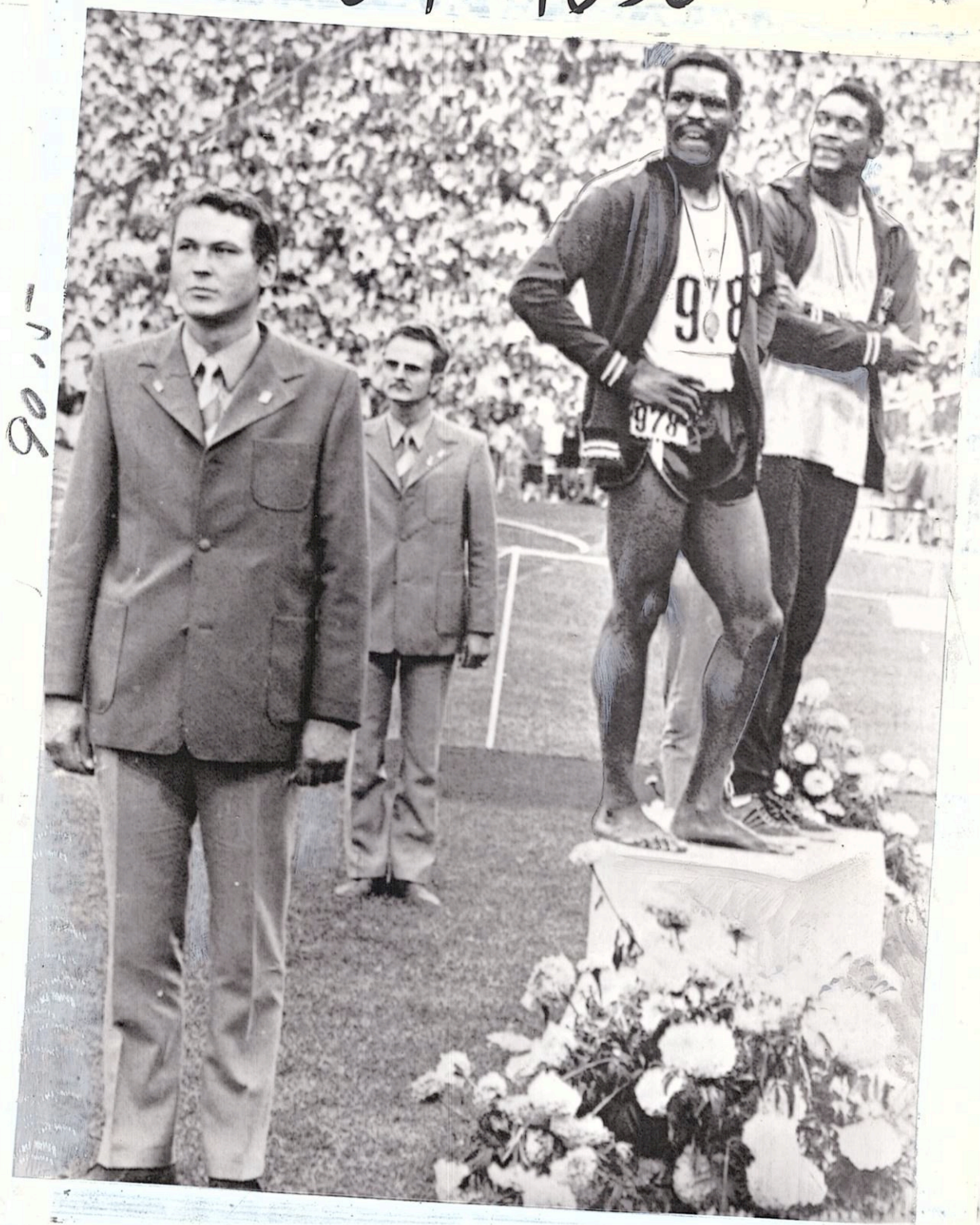
(OLY-69 MUNICH, SEPT. 7--AMERICANS BOOED)... medal ceremony is played and Olympic officials stand at attention in the Munich Olympic stadium Thursday silver medal winner Wayne Collett, of Santa Monica, Calif. (978) and gold medal winner Vincent Matthews, of Brooklyn, N.Y., slouch on the podium during victory ceremony which followed the 400-meter event. The crowd booed the U.S. athletes for an apparent show of disdain but Matthews said they did not intend disrespect. (See AP sports wire story) (LL51600stf) 1972